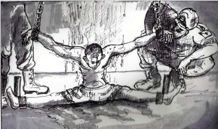
Figure 5 - An artist's drawing portraying 'water torture'. © Chijioko Ugwu Clement

Some former detainees have also described other forms of abuse that may violate the absolute prohibition of torture and other ill-treatment, including experiencing mock executions and being forced to watch other people being extrajudicially executed. As a result of increased scrutiny by human rights non-governmental groups, Nigerian human rights organizations have reported new methods of torture aimed at hiding visible marks on the body of victims. This include covering the ropes used in tying up suspects with cloth to avoid any mark on the body; and tying the upper arm of suspects with rubber to choke the flow of blood and covering detainees with plastic and placing them in the sun until they die.