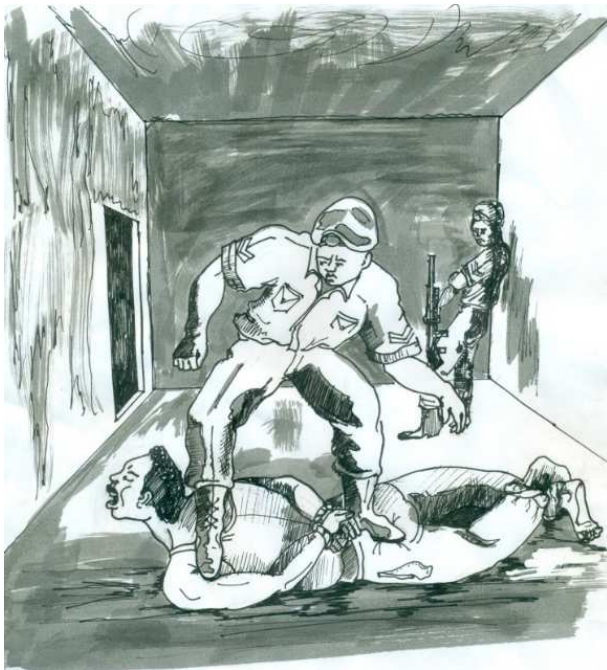
Figure 6 - An artist's drawing depicting Ahmed's account. © Chijioke Ugwu Clement

Many of my colleagues did not make it [died in detention]. The beating, the torture was just too much for us. They do all types of things to you, the soldiers. They will tie your hands behind your back, with the elbows touching and then one of them will walk on your tied hands with their boots. Your hands will remain tied and then they’ll pour salt water on your wounds. You can’t rub it, even if it goes into your eyes. My eyes got swollen as a result of that. I thought I was going to be blind. I have never experienced such brutality in my life.” 23