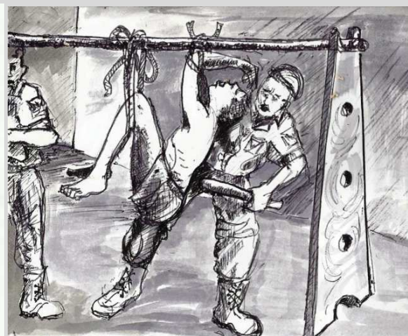
Figure 4 - An artist's drawing depicting the suspension of a detainee from a rod. © Chijioko Ugwu Clement