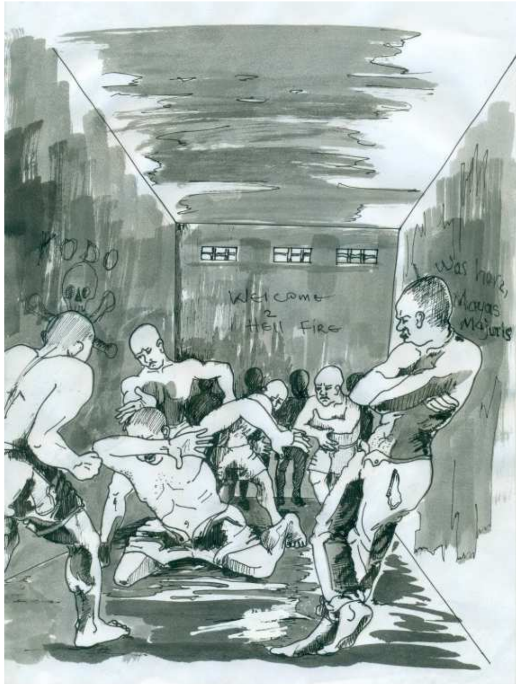
Figure 9 - An artist's drawing depicting Chinwe's account. © Chijioke Ugwu Clement