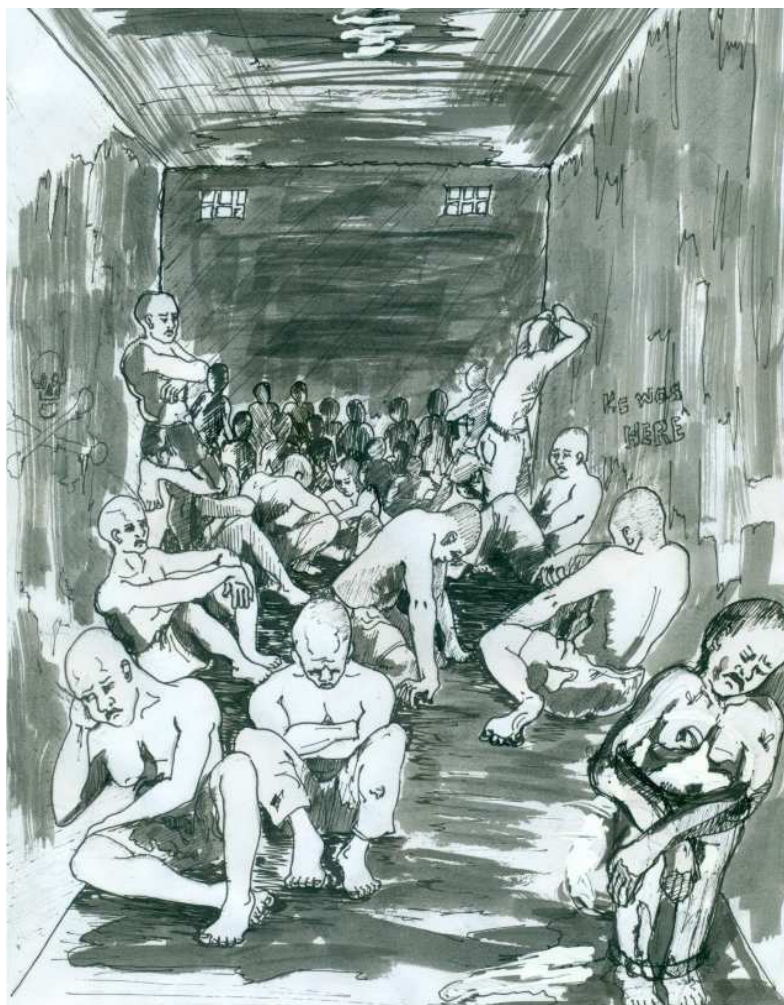
Figure 11 - An artist's drawing depicting Mustafa's account. © Chijioke Ugwu Clement

Conditions in detention facilities in Damaturu are also poor, and appear to amount to ill-treatment. Most of the detainees are kept at 'Sector Alpha' which consists of shops that were deserted and are now being used to detain people – there are no toilets or proper ventilation. Consistent accounts recorded by Amnesty International suggest that up to 50-70 people are put in cells that can only fit about five people. Conditions are marginally better at the Presidential Lodge (“guardroom”) also in Damaturu where detainees are kept in rooms that have been created by dividing a former squash court. About 15-20 people are kept in a room of 15 by 20 feet, but detainees are allowed to move around in the corridors during the day. There are also some toilets for common use at the end of the corridor.