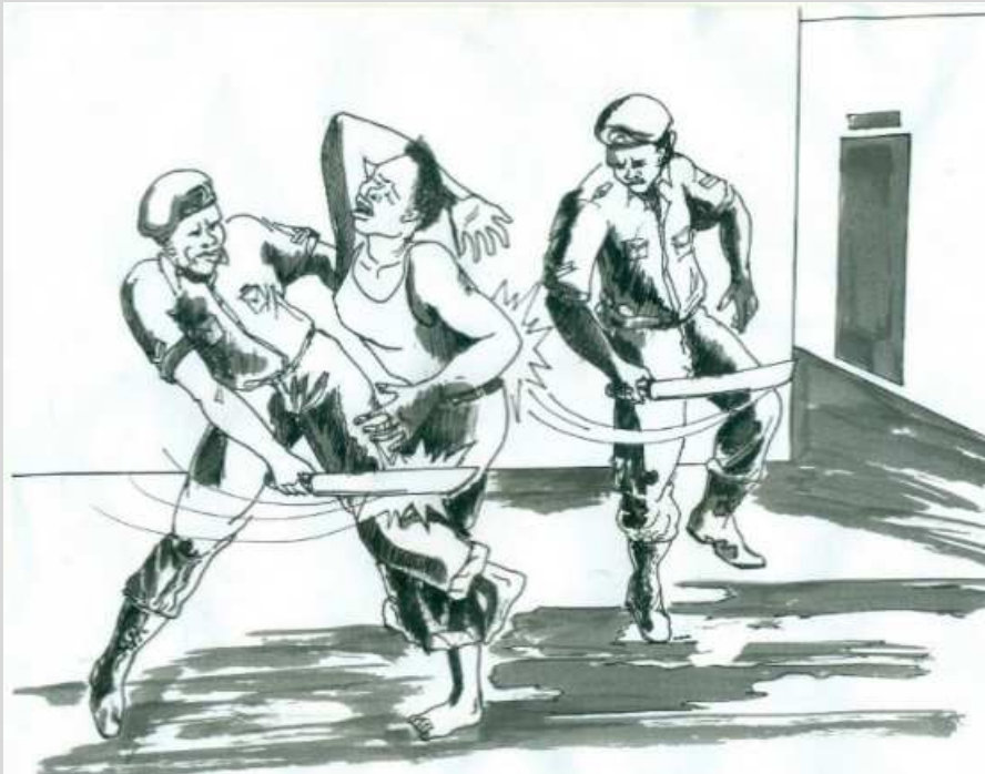
Figure 1 – An artist's drawing portraying a beating with machetes. © Chijioko Ugwu Clement