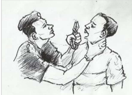
Figure 2 - An artist's drawing portraying a tooth being extracted by a police officer. © Chijioko Ugwu Clement