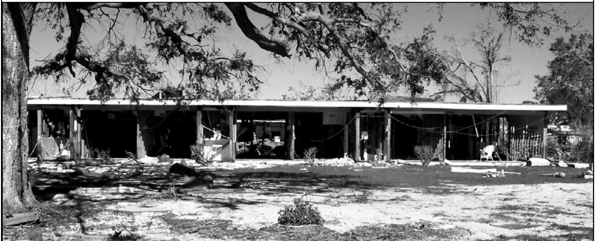
Figure 1. Photo of Destroyed Selected Nursing Home in Mississippi